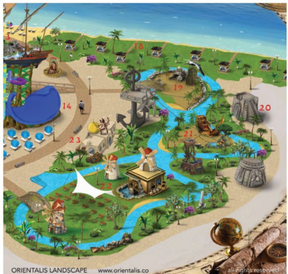
ORIENTALIS LANDSCAPE www.orientalis.co All rights reserved

It's also been requested by a client to construct private villas with pools so families can enjoy their own space. Either way, families are destined to have a memorable experience! ■